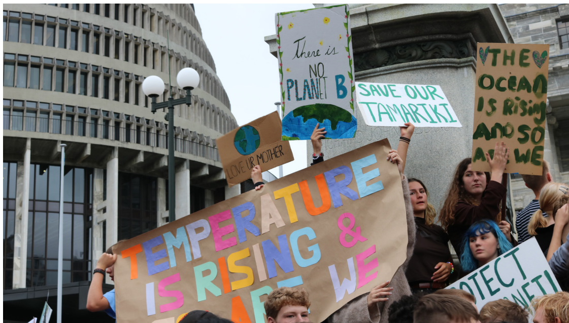
Children and young people protesting outside Parliament, 15 March 2019