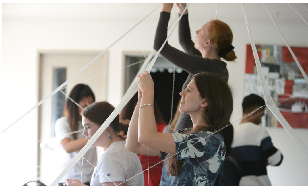
Young people preparing for the Race Unity Hui in 2019, in response to the 15 March terrorist attacks

The ten ideas that follow are based on reinforcing these three elements to improve children's participation in policy and legislative development in Aotearoa.