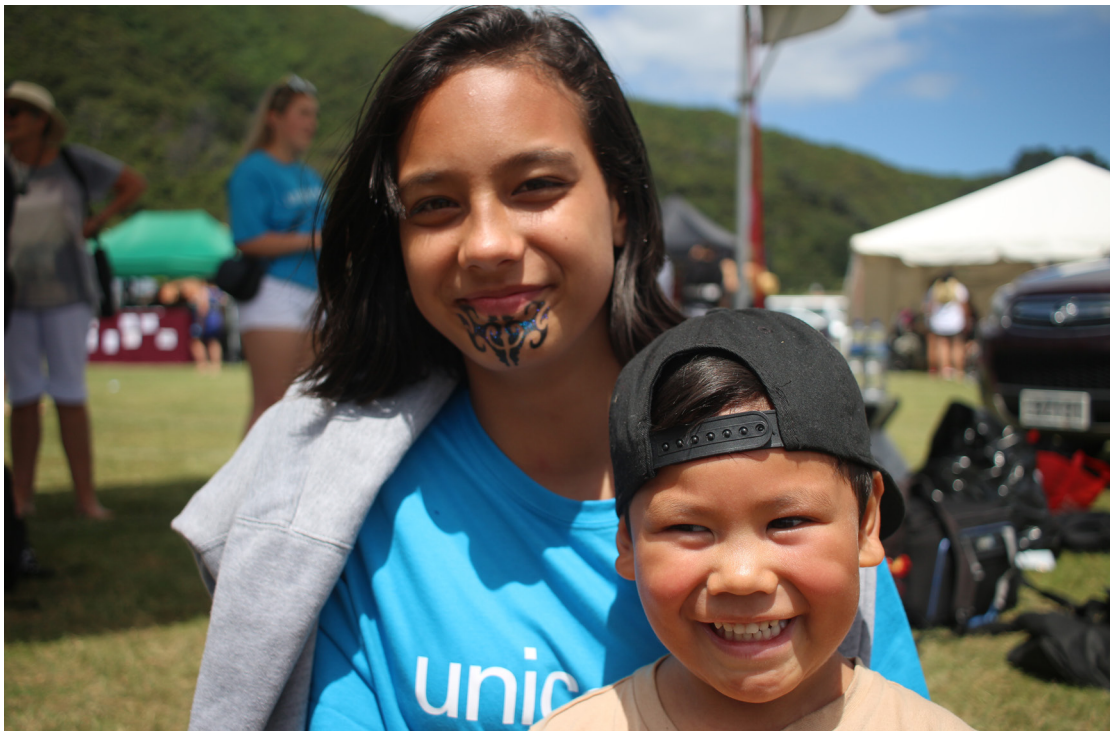
Tamariki participating in Te Ra festival

Better and more equal opportunities for tamariki Māori to participate in policy development are necessary, and there is a need to strengthen efforts to ensure that these opportunities take place in the context of whānau. There is also a need to better understand and frame how indigenous rights could lead to greater participation, rangatiratanga, non-discrimination and equality for tamariki Māori. Ensuring tamariki and rangatahi Māori are included in the consultation process for the plan of action for implementing UNDRIP is an upcoming opportunity.