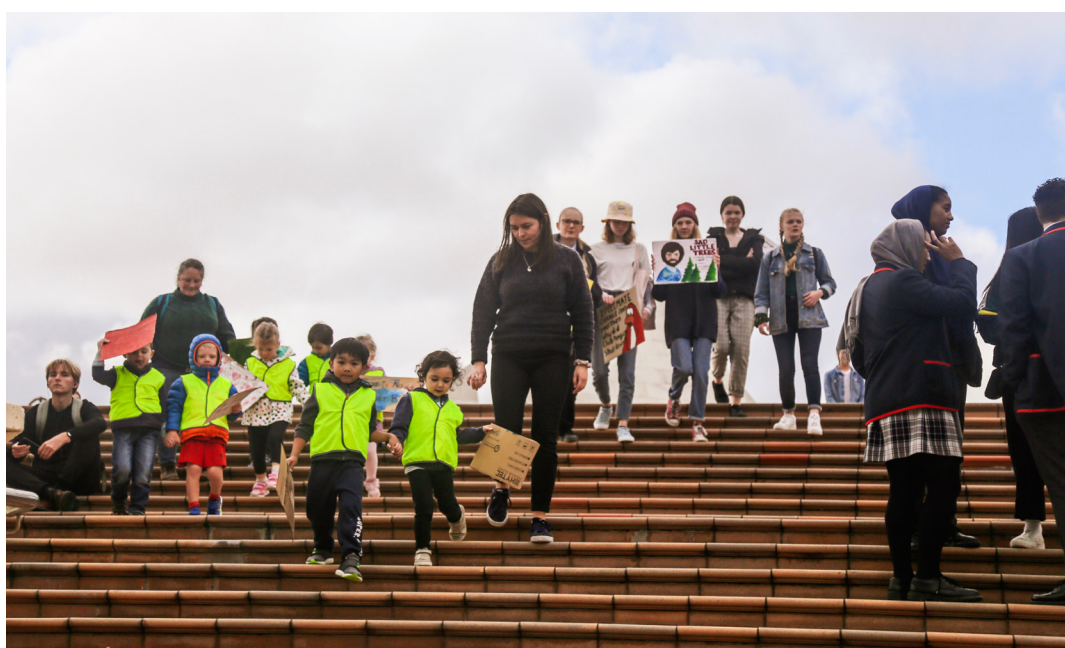
Children participating in climate strikes in 2019