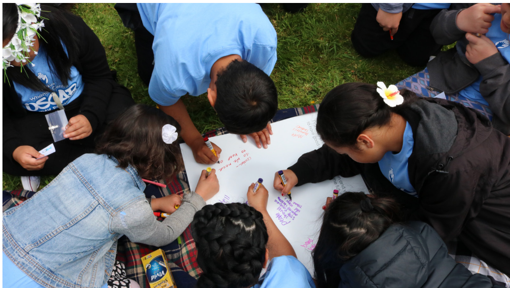
Children and young people giving their views for 'What Makes a Good Life?'

The Office of the Children’s Commissioner is well placed to assist government agencies with how to facilitate seeking the views of children, and there are many resources available to support this (see appendix three).