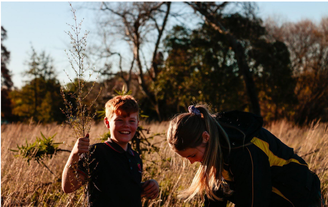
Children planting trees as part of the climate strikes in 2019

The CMG is encouraged by the recent increase in interest, and some action, from government agencies in seeking and considering children's views in the policy and legislation process. However, responses to the questionnaire coupled with a scan of recent policy development shows an inconsistent approach across government agencies to seeking and considering the views of children. The challenge is how to ensure the momentum for valuing children's participation isn't undermined by a lack of support for how to do it well.