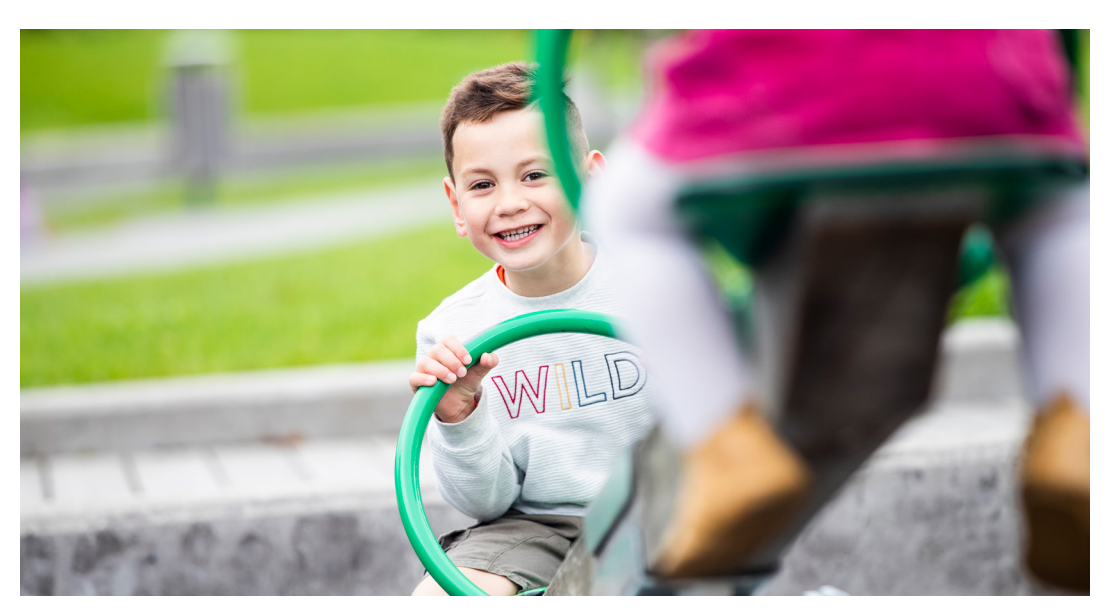
Child playing on the playground

In response to the ongoing impact of COVID-19 on students' learning, many schools changed what and how they taught to support student learning after the lockdowns. In an ERO survey, four out of ten schools interviewed changed their curriculum, a third their teaching practices and how they use support staff, and a quarter their learning relationships with whānau.<sup>138</sup>