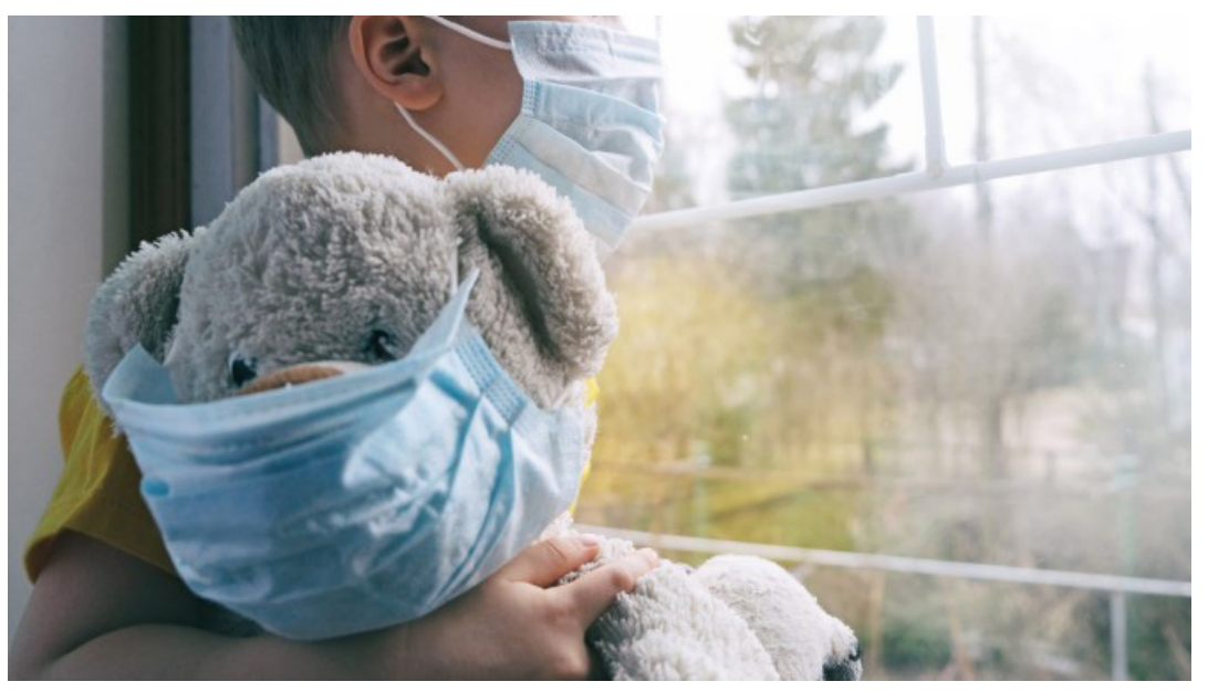
Child with teddy bear and mask

While most cases have originated overseas, the largest community outbreak (the Auckland August 2020 cluster) included a higher than expected proportion of cases in children and young people, particularly Pacific peoples, consistent with previous inequities in infectious disease outbreaks in Aotearoa. As a result of this outbreak there are concerns that existing health inequities may result in some children and young people in Aotearoa experiencing worse impacts on their health from widespread community transmission than children overseas have experienced. This has implications for the vaccine strategy and for ongoing protection of communities from the risk of COVID-19 outbreaks. Ensuring equity of outcomes, especially for Māori and Pacific peoples in health responses to COVID-19 is critical. 101